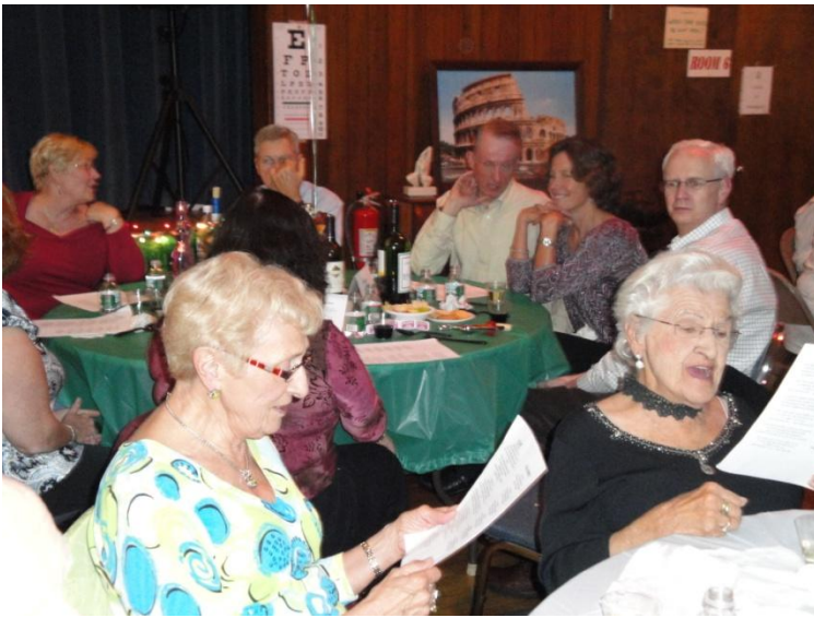
Guests enjoy the Italian Night sing-a-long October 2, 2010